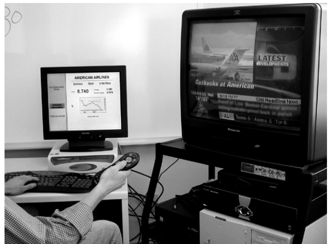
Figure 1. A television viewer receives information on a computer (left) after using the remote control to signal interest in the story currently on the television.

Imagine a viewer is watching a news story about the latest negotiations in the Middle East peace process. He might want to learn about the Palestinian and Israeli reactions to these developments, so while viewing the story he presses the 'interest' button on his remote control. Within seconds, Cronkite provides him with expanded information, on a nearby computer display, related to the story he was watching. The system presents the viewer with maps and a history of the Palestinian-Israeli conflict, as well as information about political leaders, such as Yasser Arafat and Ariel Sharon. Cronkite also provides pointers to related stories from sources such as The New York Times and Google News. If the user wants to learn about the Palestinian and Israeli viewpoints he can navigate to the opinion section, where Cronkite displays summaries and links to stories from the Jerusalem Post and the Al-Ahram. These stories may include coverage of a press conference with the Israeli foreign minister as well as an interview with the Palestinian chief negotiator.